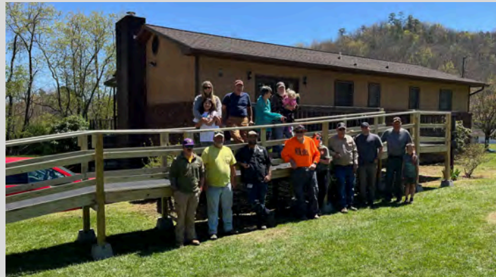
With assistance from New Hope Baptist, Project CARE built a 50' ramp for a client in Sylva.