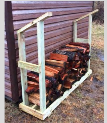
The Project FIRE team is working on providing firewood racks to clients without adequate cover. We called all our clients inquiring about their status and will starting building and delivering the firewood racks this month.