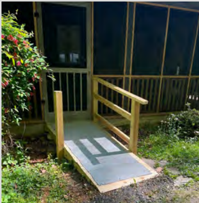
Daniel built a 7' ramp for a client in Whittier.