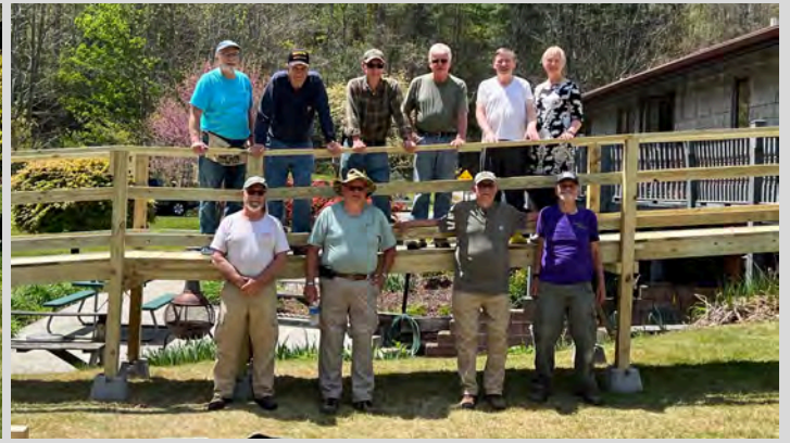
First Baptist of Sylva sent an amazing team of volunteers to assist Project CARE in building a 60' ramp for a client in Sylva.